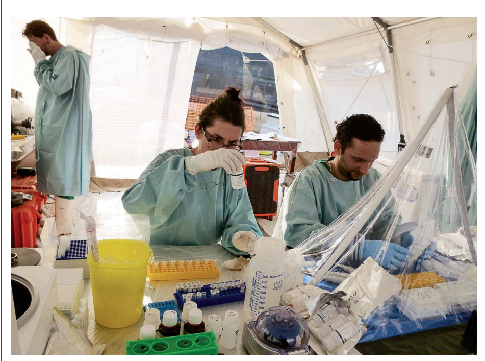
Members of the European Mobile Laboratory Project use PCR tests in Guéckédou, Guinea.

door screening campaigns. At least two of the potential diagnostics will undergo their first field trials in Guinea and Sierra Leone