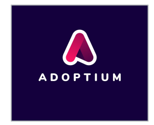
Color gradient, negative, white type