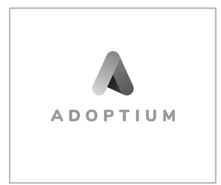
Grayscale gradient, positive