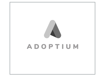
Grayscale pure, positive