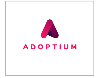
Color gradient, positive