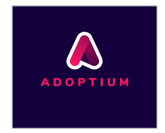
Color gradient, negative, red type